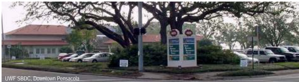
UWF SBDC, Downtown Pensacola